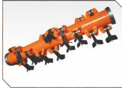
Dynamically balanced seamless rotor pipe encourages vibration free mulching