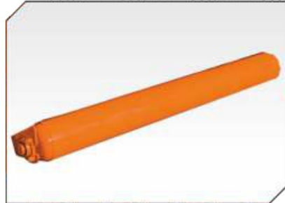
Adjustable roller height ensures compact & ever spreading of mulching rayer