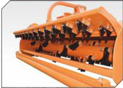
Bigger rotor drum / chamber chawing better & effective residue burning without chalking