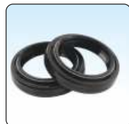
Duo Cone Mechanical Oil Seal