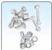
High Tensile Bolt Fasteners