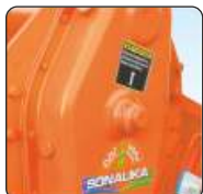
Double Support Idler Gear