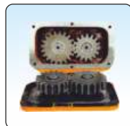
Four Speed Gear Box