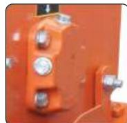
Oil Immersed Side Bearing