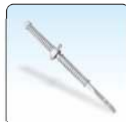
Flexible Adjustable Trailing Spring