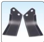
International Quality Boron Steel Anti Wear Blades