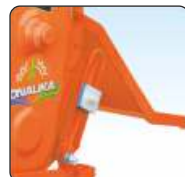
Precise depth adjuster