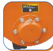
OIL IMMERSED SIDE BEARING