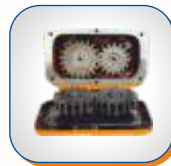
FOUR SPEED GEAR BOX