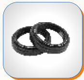
DUO CONE MECHANICAL OIL SEALS