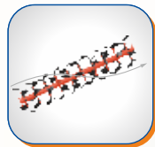
HELICAL ARRANGEMENTS OF BLADES