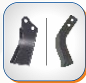
AVAILABLE WITH L&J TYPE BORON STEEL BLADES